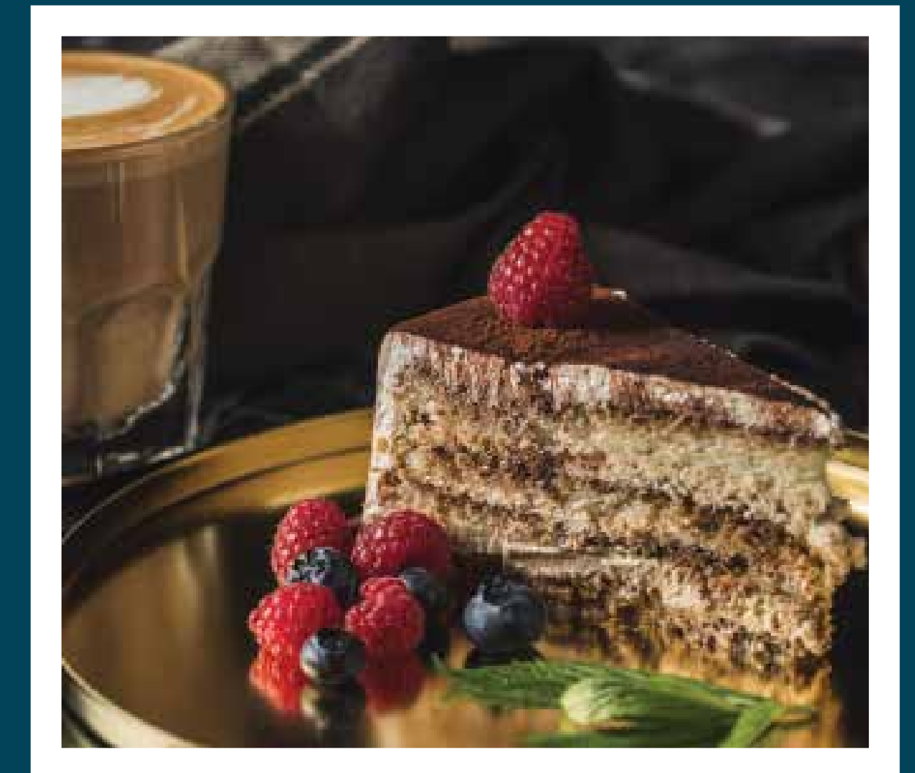
COFFEE AND CAKE FROM THE DISPLAY CABINET